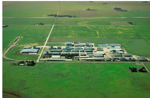
Van Diest Supply Company present day

The office was 5' x 10' in the house, just off to the right of the door.