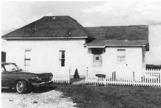
Van Diest Supply Company in 1956

Van Diest's IT team is armed and ready for whatever its growing business throws at it.